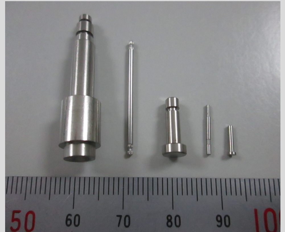
Mechanical pin, shaft parts (material : Steel, Stainless etc.)