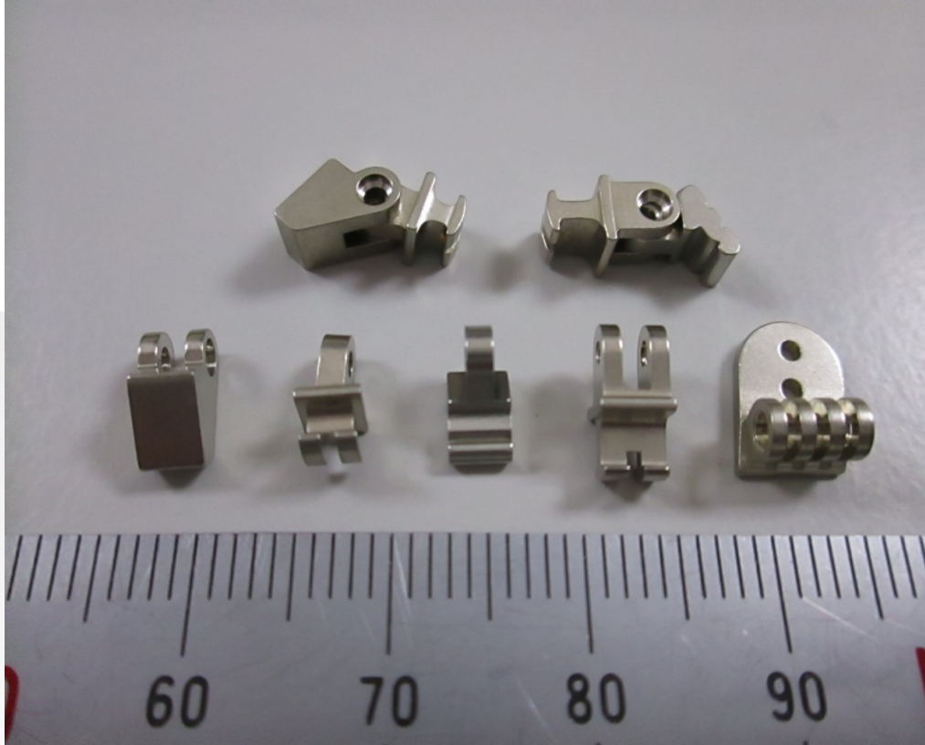
Spectacles hinge parts (material : Nickel Silver)