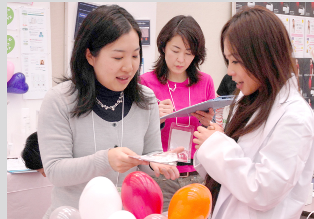
sample distribution event