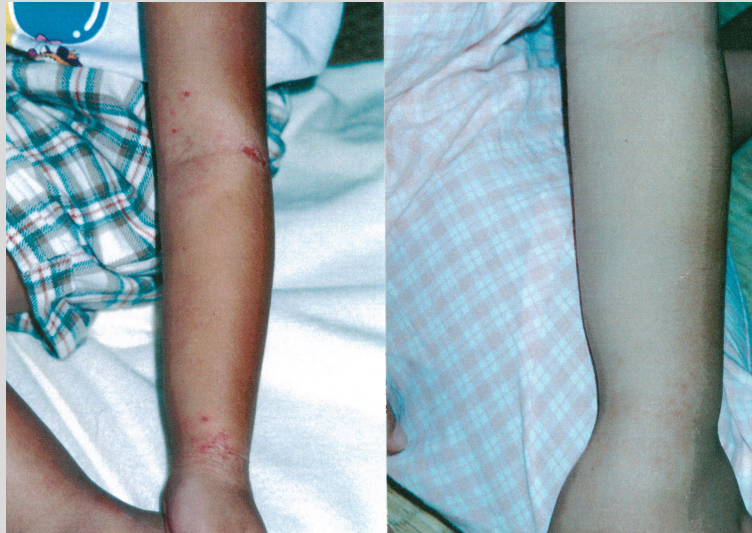
Typical symptoms of atopic dermatitis After treatment with skin care the progress of a three year – old girl