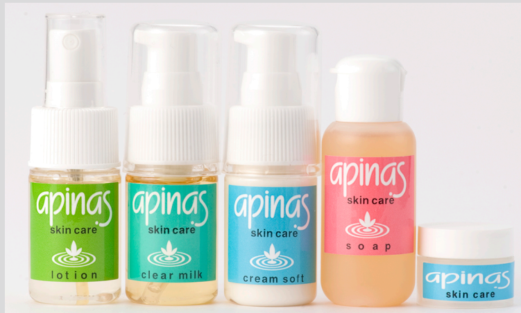
Samples for patch test